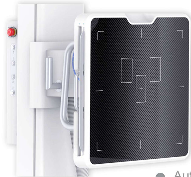
● Automated tilting Bucky